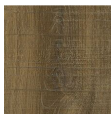
Gifford Oak 00703 LRV 11 V3 - Moderate Variation